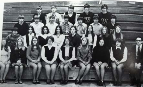
"Noblesse Oblige" 1972

To receive it via e-mail—Drop us a message at mailbox@norsefund.org Or Become friends with us on Facebook