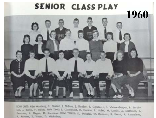
SENIOR CLASS PLAY