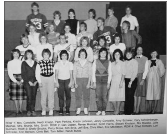
1985 Forensics Team 1970 Student Council