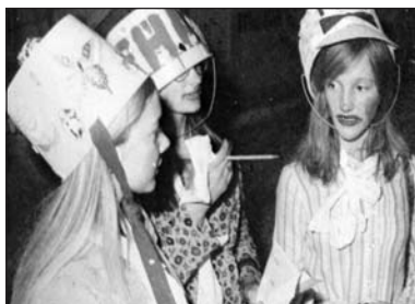
FHA Initiation - 1977