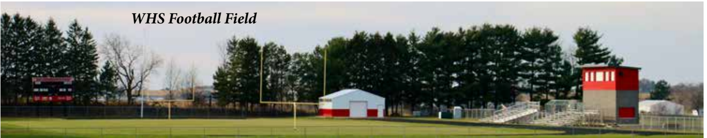
WHS Football Field

* First Grade Enrollment numbers are usually a little low.